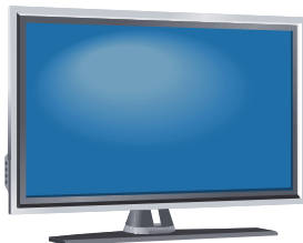
Flat Screen TV*