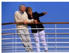
Vacation voucher Worth $1500*